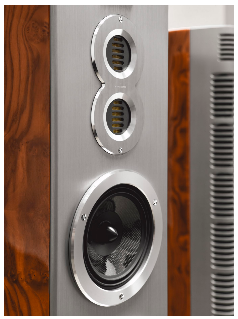
Audiovector ApS \cdot Mileparken 22A DK-2740 Skovlunde Denmark \cdot www.audiovector.com