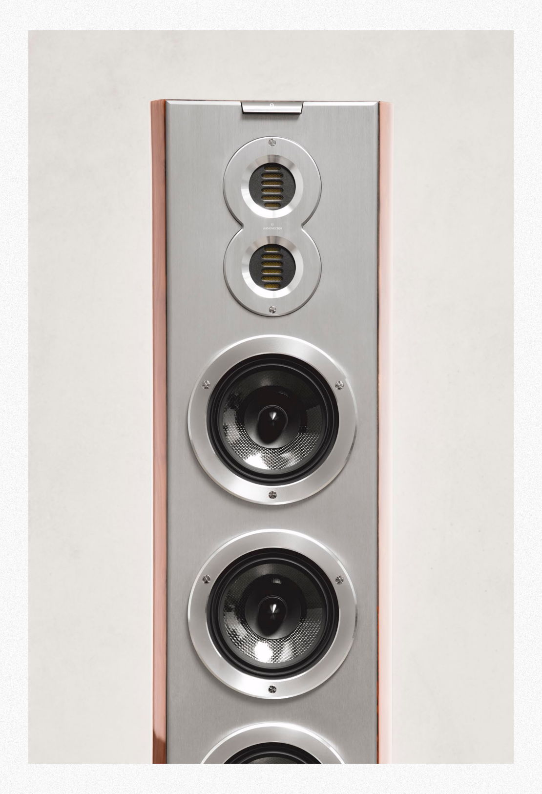
Enter the dual dimension